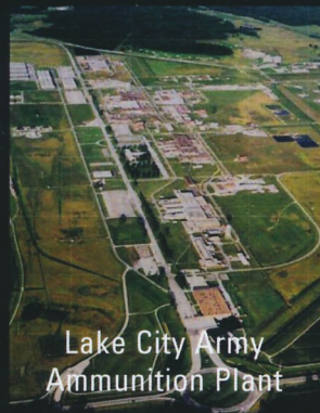
Lake City Army Ammunition Plant